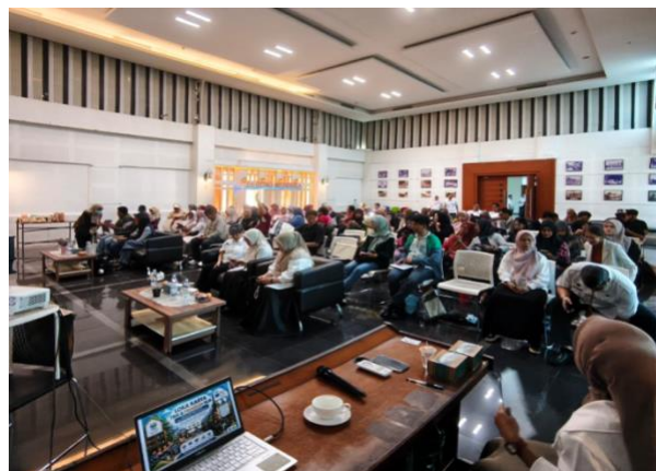
Figure 2. the participants joined the KLIK Festival