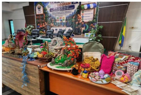
Figure 1. MSME product displays from participating urban villages at the KLIK Festival

The program was implemented at the Bandung City Department of Archives and Libraries, located in Bandung City, West Java, Indonesia. The scope of engagement covered institutional-level processes and selected service units to ensure that the intervention addressed both managerial and operational dimensions of public library services. The total number of direct participants involved in the program was approximately 30–50 individuals, representing key functional units relevant to library service innovation and governance